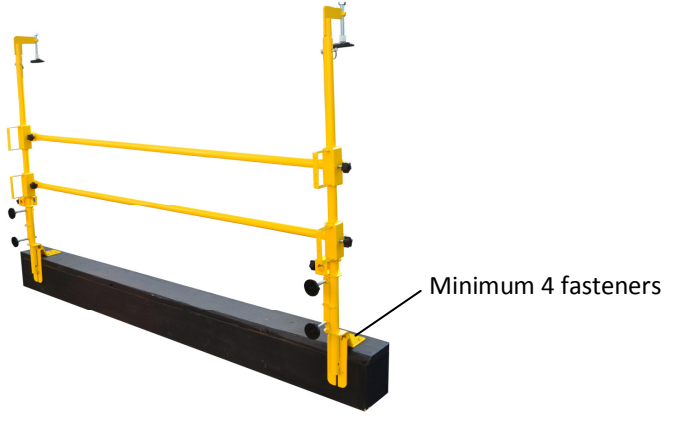
Wood Surface Application

Wood Applications: Four to six #14 coarse thread wood screws with 1.5" penetration per screw in each All-In-One Base into a solid wood base that is either an integral part of the structure or securely attached to the structure.