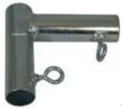
Standard Elbow, Qty: 2