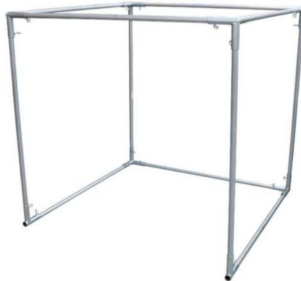
Finished Frame ->