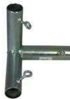
Corner Ass'y, Qty: 6