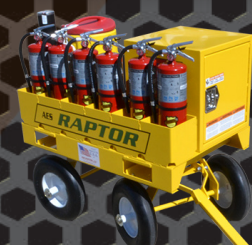
ICE CART Standalone Unit ICE-PE-000-12