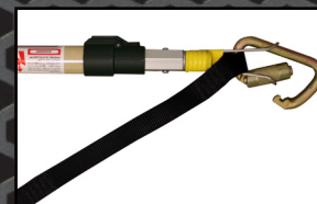
RaptorRescue™ Pole Attachment