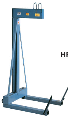
HF1000 Hoist Fork